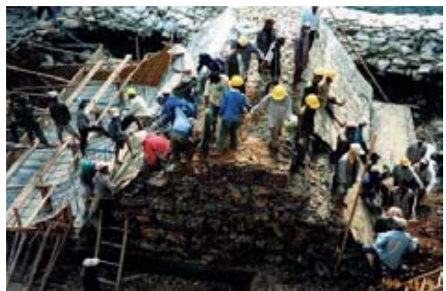
Demonstration project on the NamMong Power Plant (output: 70 kW) in Laos