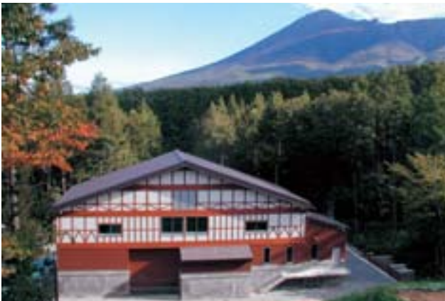
Miyakashiwadai power plant (output: 2,700 kW) in Iwate prefecture

Therefore, according to requests from institutions such as municipal electric enterprises, technical guidance and support is provided concerning the formulation of concrete development plans, the conduct of surveys, design, construction, and so on. For institutions such as municipal electric enterprises who are considering development in the near future and who do not have sufficient technology and well-developed management systems, guidance is provided based on government subsidies (subsidy rate 50%).