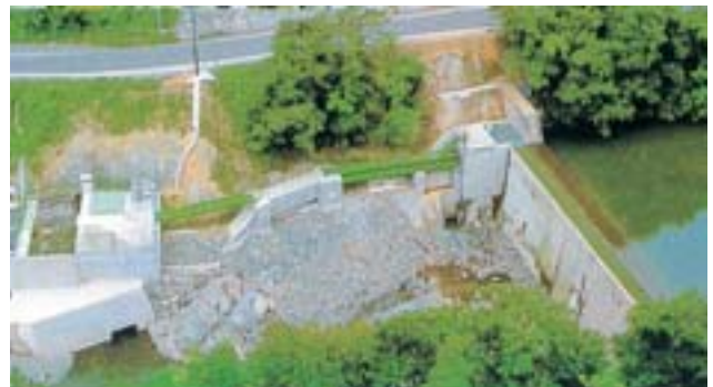
Small-scale hydroelectric power generation plant using a sand control dam

Since these technologies can make use of the existing facilities, such as water intake systems, they have the advantage of having an extremely low impact on the natural environment compared with new developments.