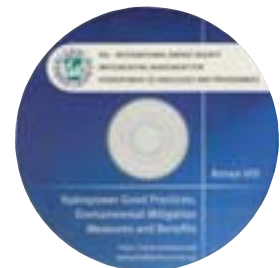
IEA implementation agreement on the hydropower Annex-VIII Report "Outstanding hydropower case examples (environmental mitigation measures and benefits)"