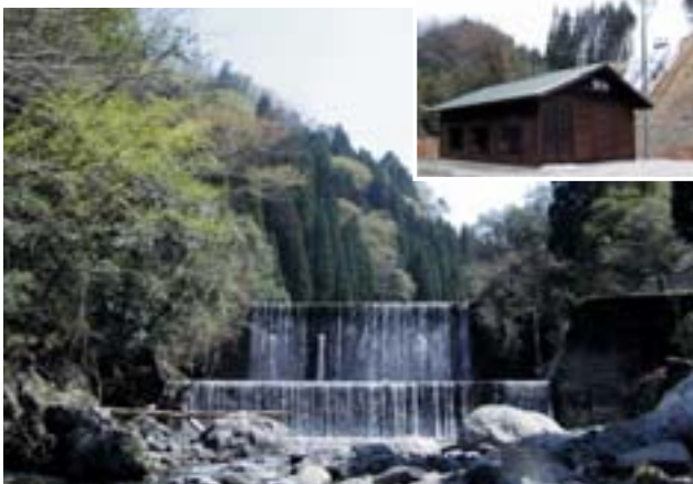
A Hydrovalley project has been planned and constructed for the intake weir (with effective use of the existing sand control dam) of the Seiwa power plant (output: 190 kW) in Yamato-cho (Kumamoto prefecture) and the power plant (upper right).

In order to effectively advance the development of hydroelectric power, the center has carried out a "Survey for the Planning of Hydropower Development Sites (the fifth Survey for hydropower generation)" commissioned by the national government, which presents the whole picture of undeveloped potential water power capacity in Japan. As of March 2006, the potential water power capacity is distributed over more than 2,700 undeveloped sites. Their average output is around 4,500 kW, which represents a suitable site for a small to medium-sized plant. However, the number of remaining economically efficient sites is decreasing. In order to promote the development of these small and medium-sized power plant sites, the following work is being carried out within the framework of the "Basic Research for Small and Medium-Sized Hydropower Development Promotion Guidance Projects:" (1) a study on development promotion measures, (2) research on improving the accuracy of individual generation plans, (3) research for the development and promotion of the Hydrovalley project, (4) a study of the unutilized drop potential for water power and of generation plans in which these drops or heads are utilized, and (5) the compilation of technical information regarding hydropower development.